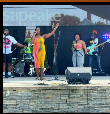
Performed at Chesapeake Pride Fest (2025), sharing the stage with popular acts from across the greater 757.