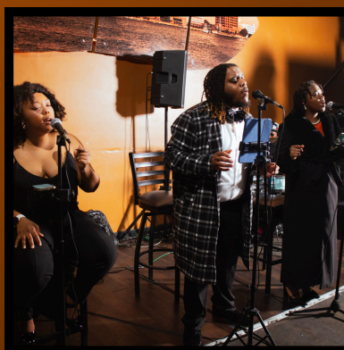
Performed at Soiree Bistro in Norfolk, VA (2025) for a blowout birthday celebration.