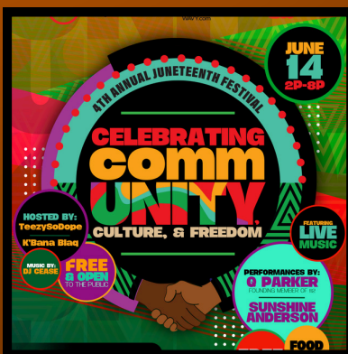
Collaborated with the band leader of the Good Vybez Band to perform at the 2025 Juneteenth Festival at the Atlantic Union Pavilion in VA.