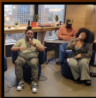
Created a "Tiny Desk"-esque performance at Gather NFK.