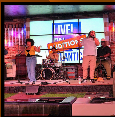
Performed for Live on Atlantic (2026), a main stage performance for professional acts in Virginia Beach.