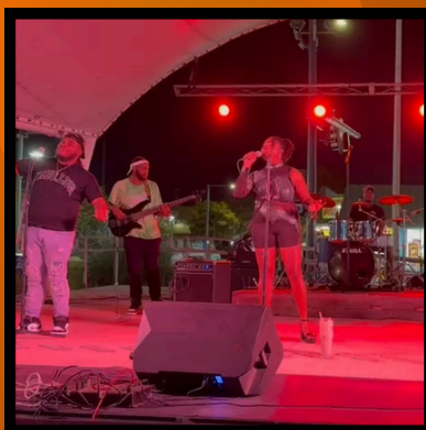
Headlined Girls Trip: Last Night Out (2025) at the Virginia Beach Oceanfront 17 th St Main Stage.